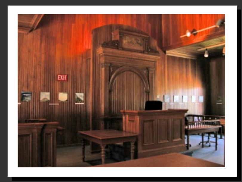
The museum was originally the courtroom