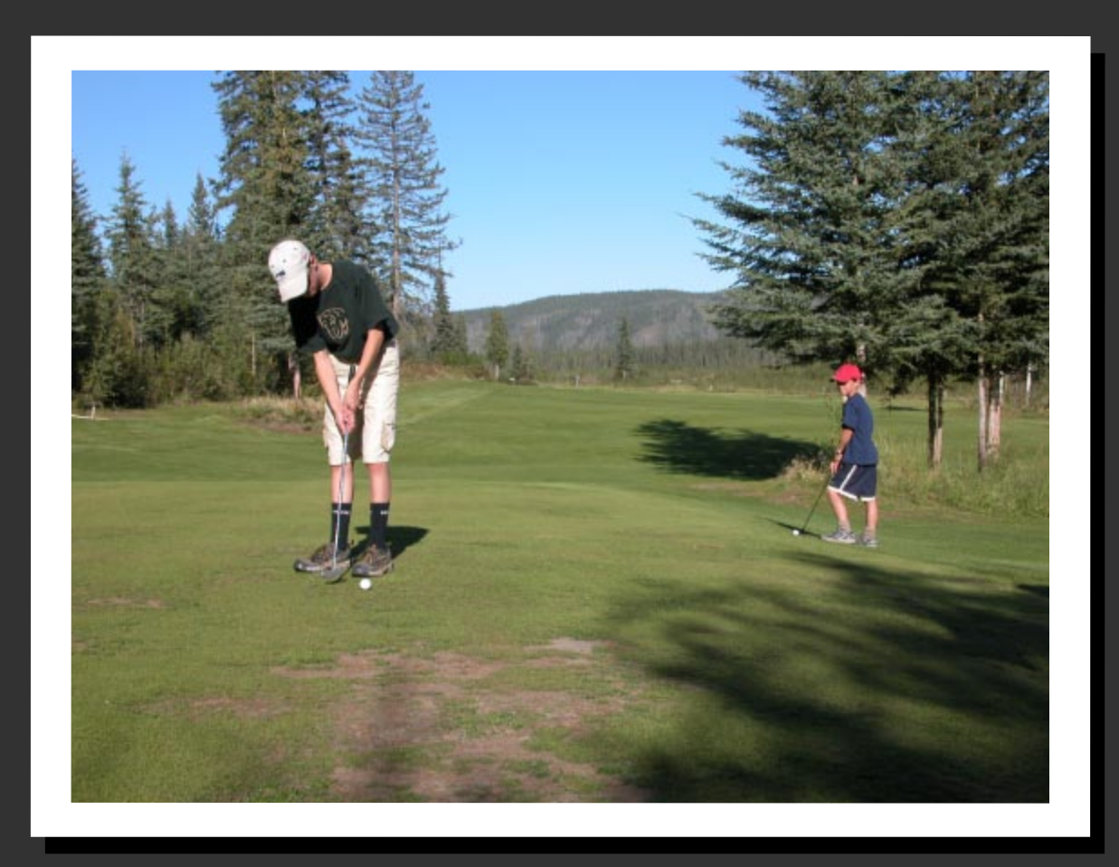
Not the best greens we've played on