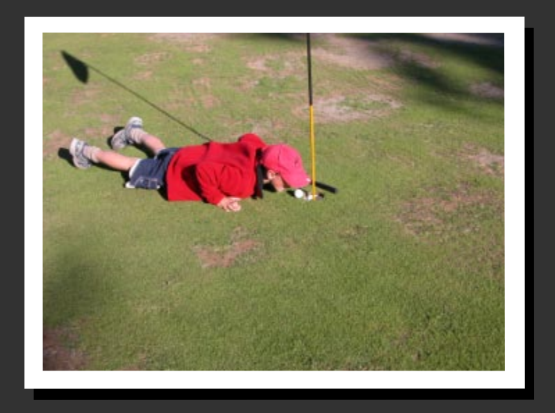
Get in there!