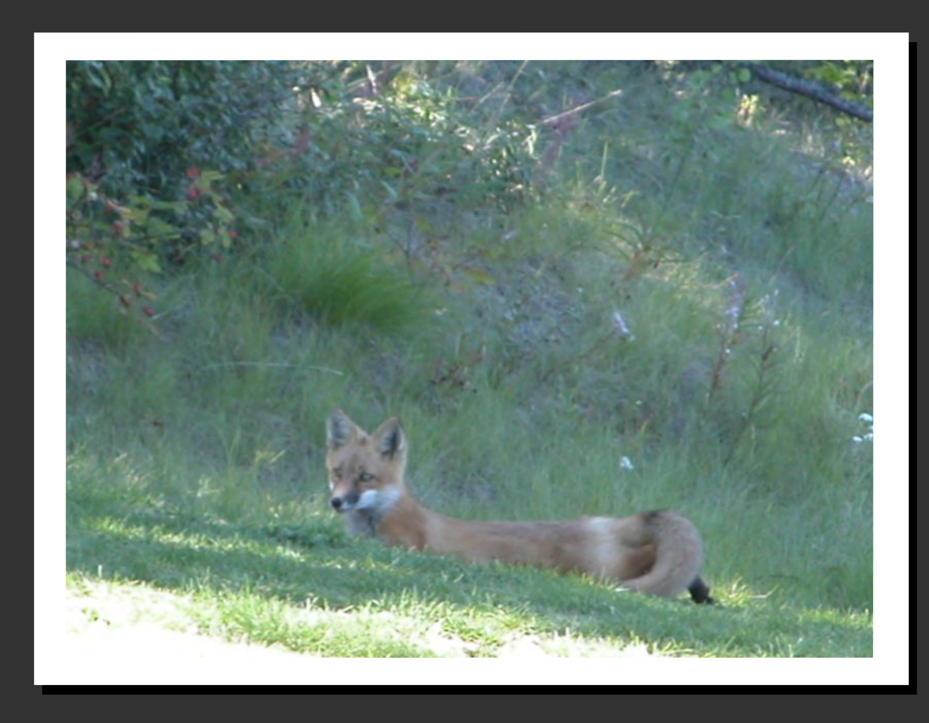
There it is?