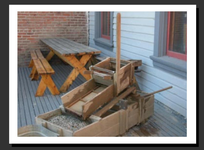
Rocker box - the poor man's sluice