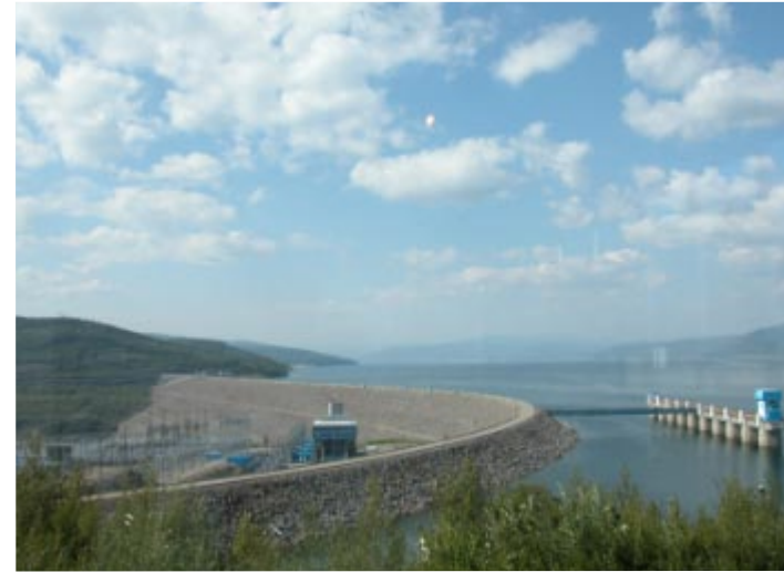
WAC Bennett Dam, intakes & Williston Lake