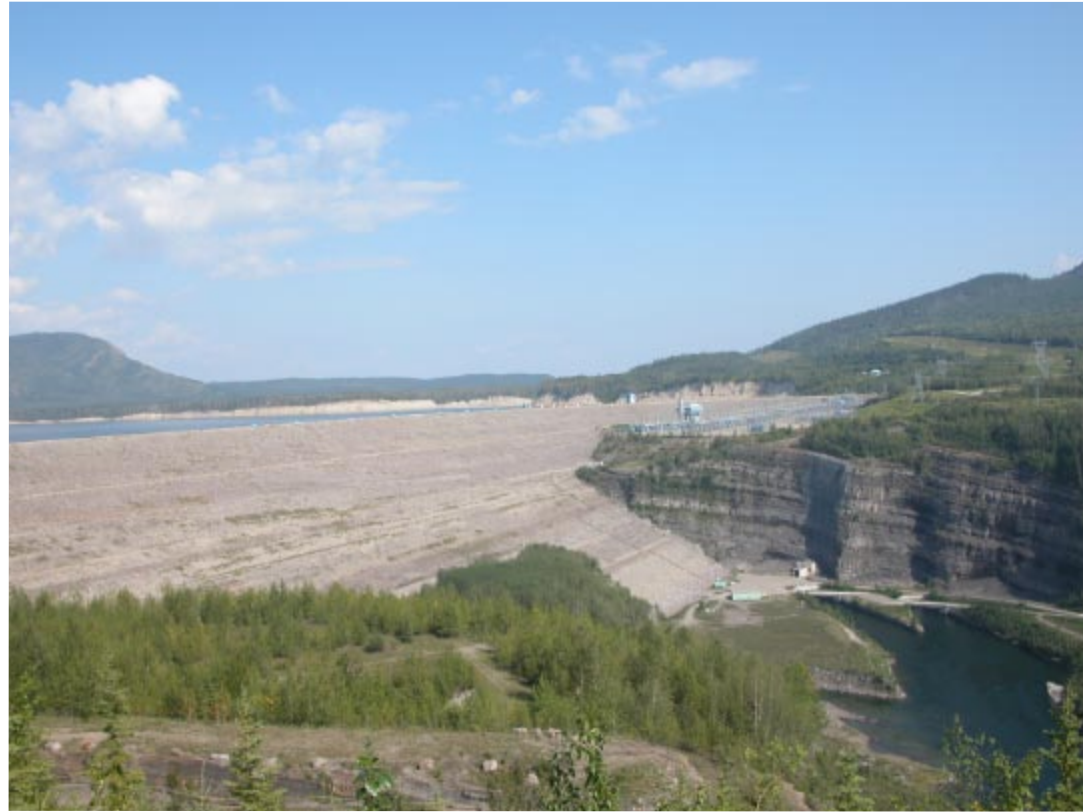
View of dam from other side