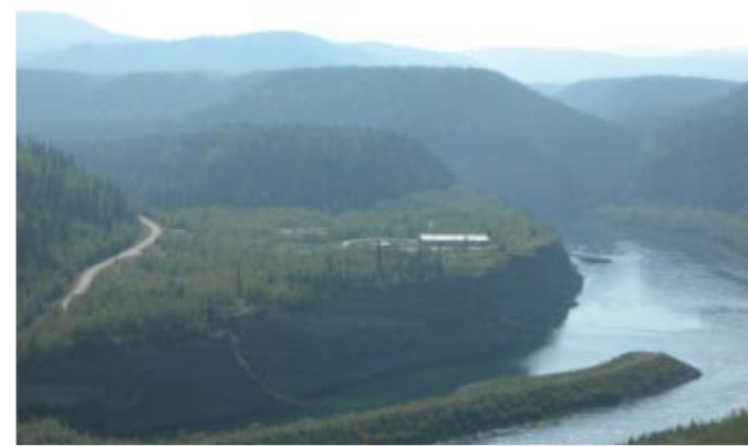
Peace River downstream from dam