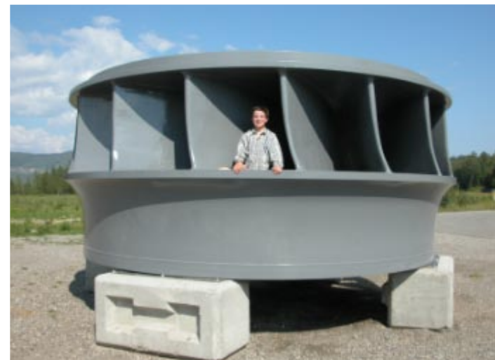
One of 10 turbines from dam