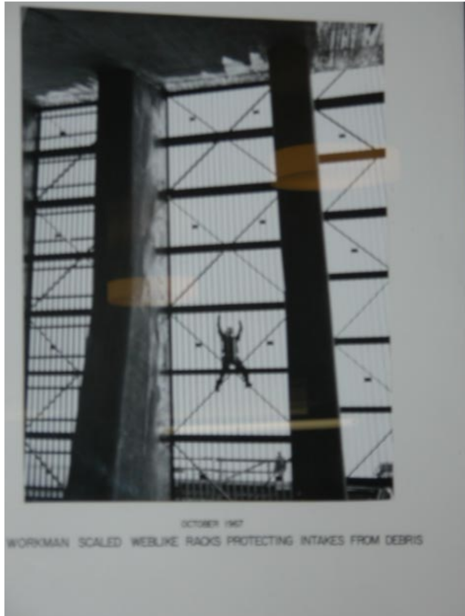
Man climbing intake screens