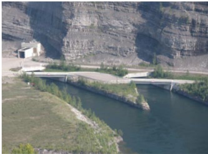
Tailrace tunnels where water exits